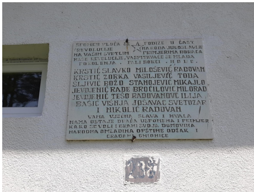
Figure 1b: Condition of plaque and inscription, June 2024