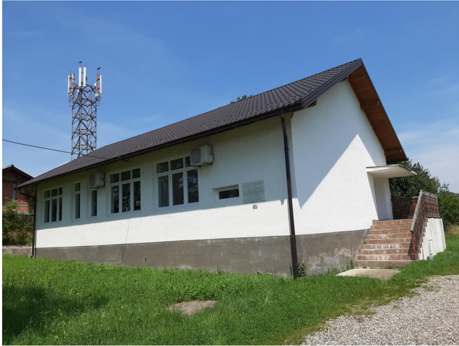
Figure 1a: Location of the plaque on the elementary school, June 2024